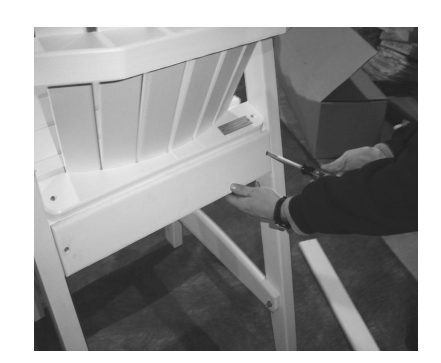
Step Six: Tightening of Hardware

Install the Rear Seat Apron using (2) 1-3/4" Phillip's Head Screws (Right Picture)